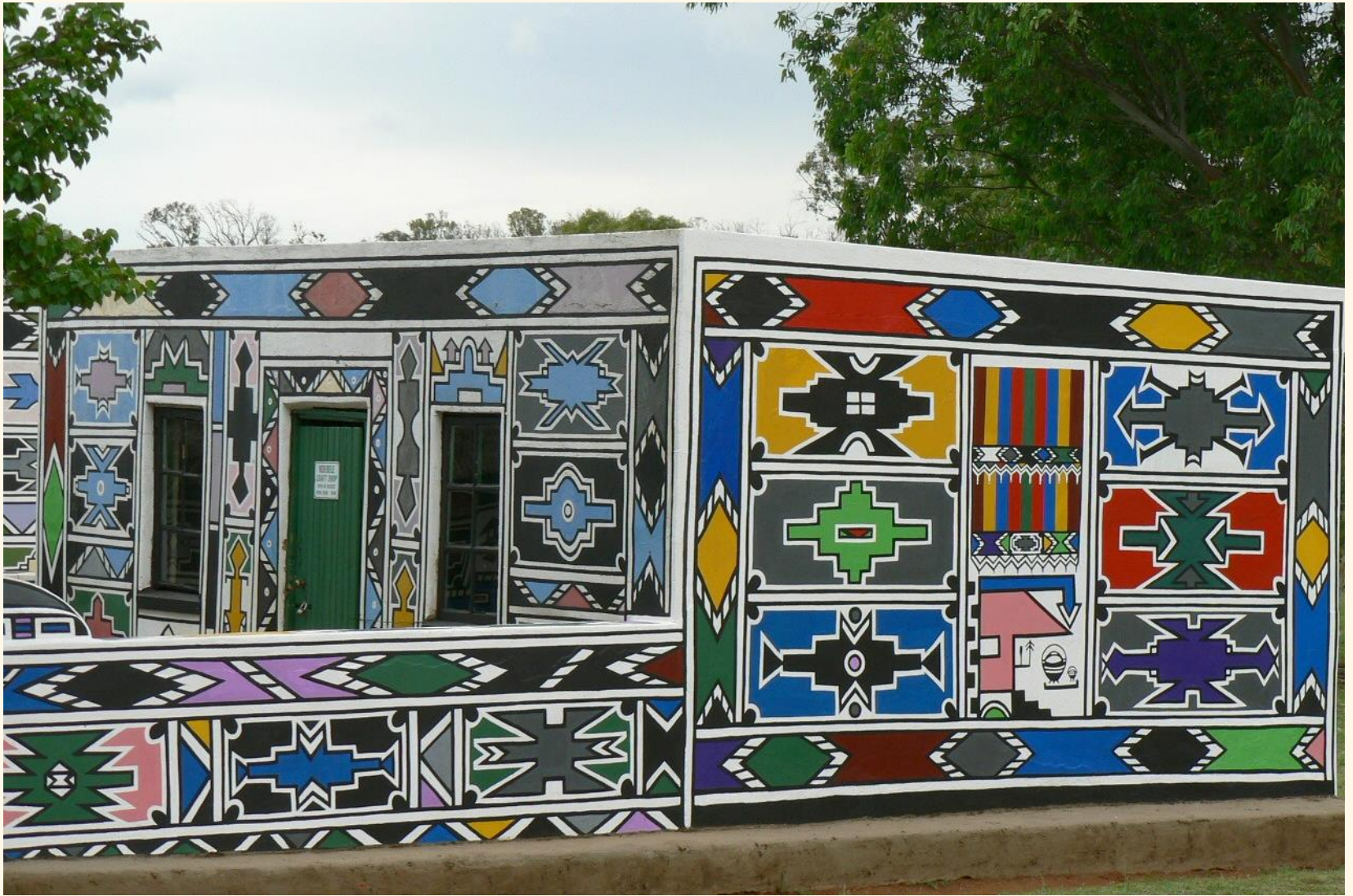
Photo courtesy of Wikimedia Commons (@wikimedia.com) - granted under creative commons licence – attribution