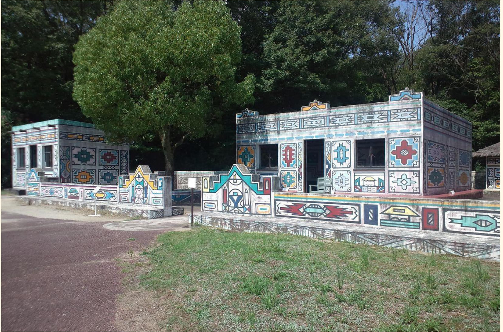
Photo courtesy of Wikimedia Commons ( @wikimedia.com ) - granted under creative commons licence – attribution