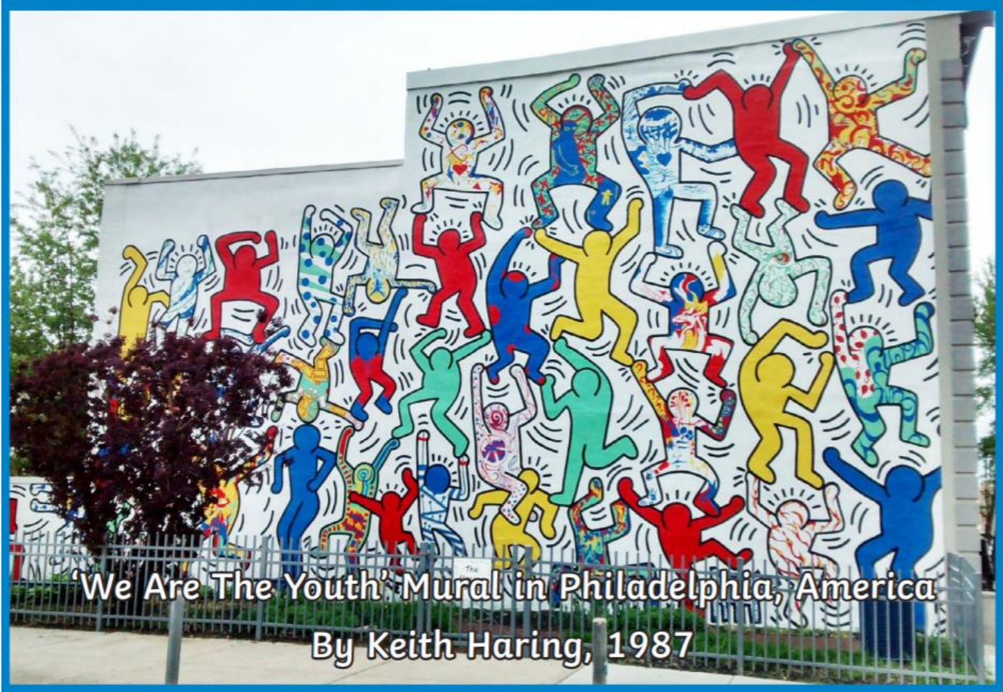
'We Are The Youth' Mural in Philadelphia, America By Keith Haring, 1987