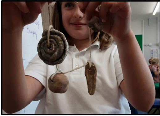
Stone age necklaces