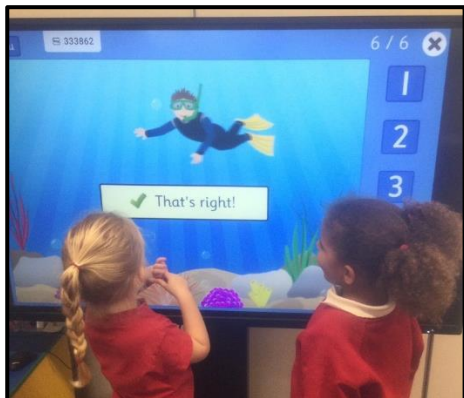
Counting activity on the Clever Touch Screen

"Thankfulness is the beginning of gratitude. Gratitude is the completion of thankfulness. Thankfulness may consist merely of words. Gratitude is shown in acts." ~ Henri Frederic Amiel