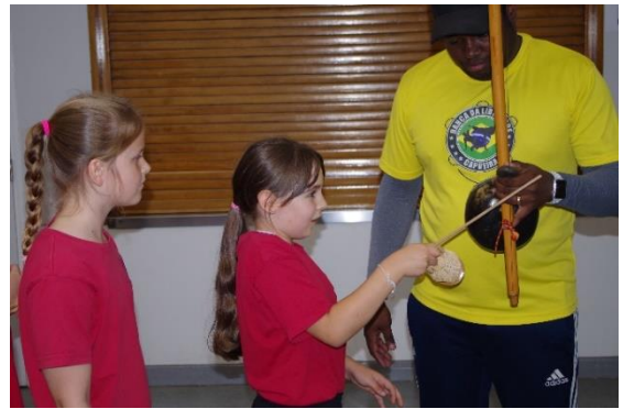
Playing the Berimbau