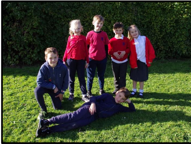
This is our Eco Action Team. They have planned a number of projects and initiatives to work towards the school getting the Eco-Schools Award