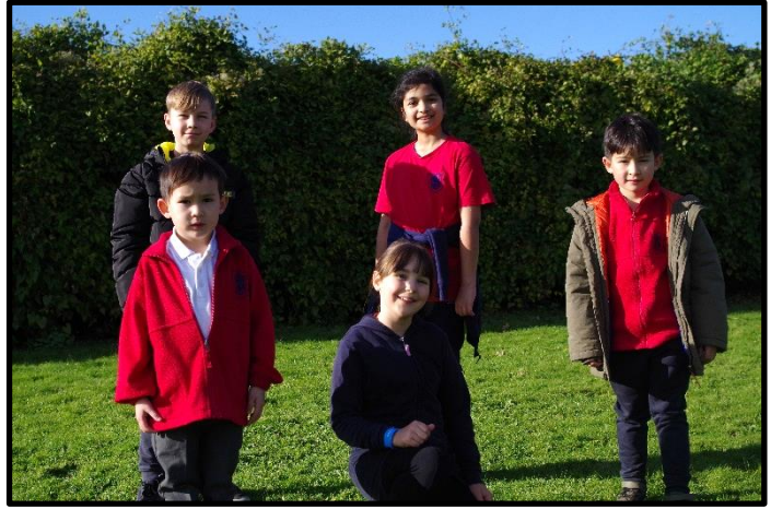
This is most of our School Council. They are currently involved in planning fundraising events and choosing the charities we will support this year.

These litter picking photos were sent in and we are always pleased to encourage such helpfulness and hard work towards improving the environment.