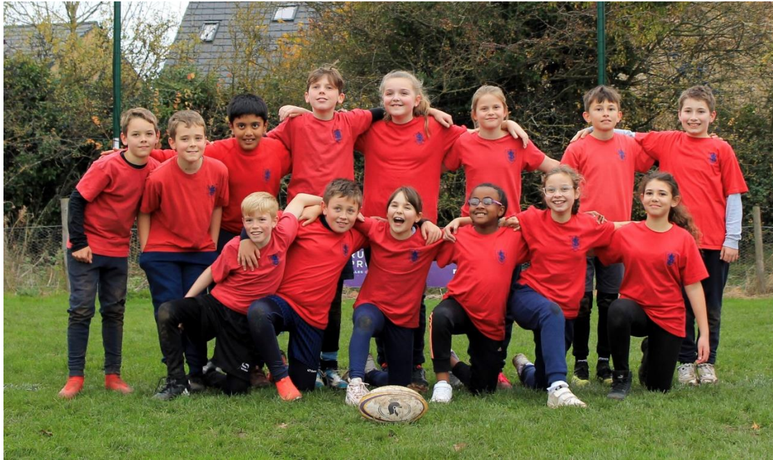
Written by Frank (Journalist Extraordinaire)

of tries. The only disappointment was when we got demolished by a school because they had a lot of super flash, high speed players. The teachers were impressed with how well we played and how we all did our best. In total we lost 2 but won 3 and amazingly we scored a lot of tries. It was super joyful and we would definitely want to play again.