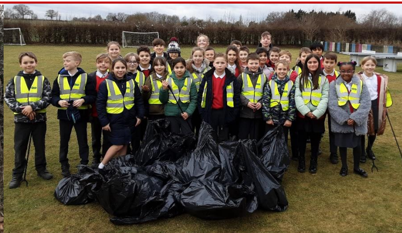
Diamond Class Litter Picking