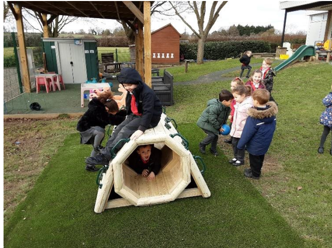
New tunnel and climbing equipment