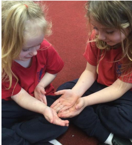
Holding 'Sticky', the baby stick insect

“Just remember, you can do anything you set your mind to, but it takes action, perseverance, and facing your fears.” – Gillian Anderson.