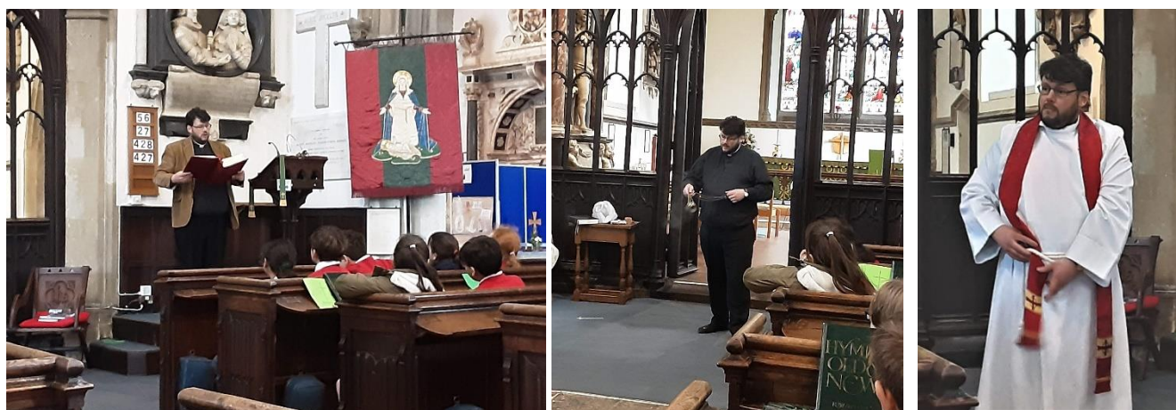
Diamond and Emerald Class at Great St Mary's Church for an RE visit.

‘Learn to do right. Seek justice.’ Isaiah 1.17