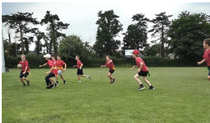
Emerald Class Tag Rugby