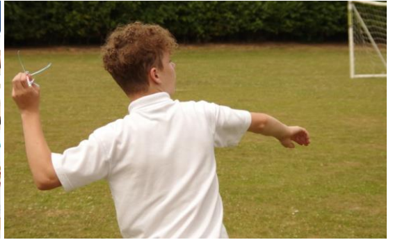
Diamond Class Glider Challenge