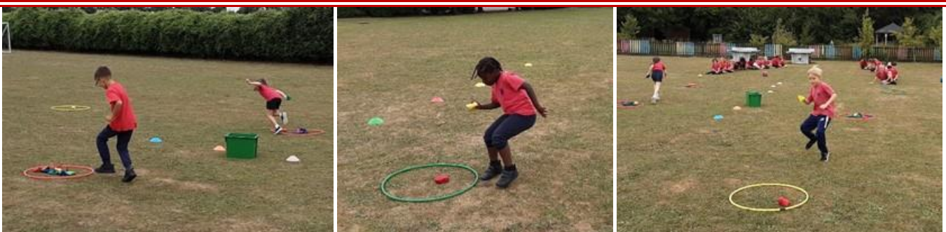
Sapphire Virtual Multi-Skills Competition