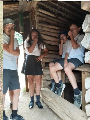
Emerald Class Trip