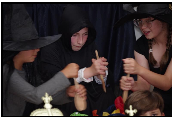
Shakespeare on Trial