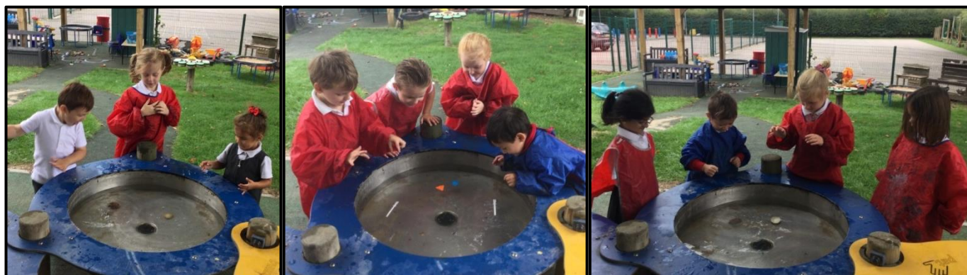
Ruby Class exploring floating and sinking

“God Loves a cheerful giver” 2 Corinthians 9:7