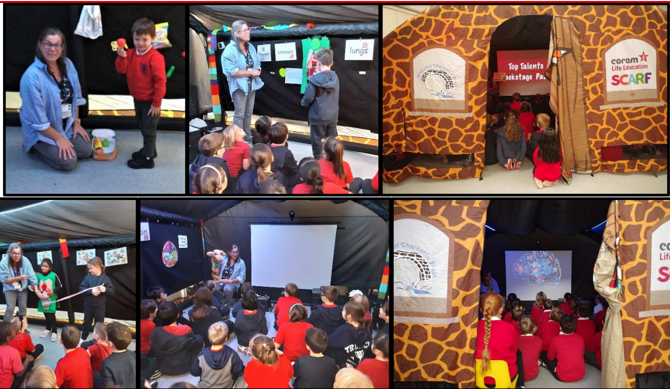
SCARF Live PSHE

“God Loves a cheerful giver” 2 Corinthians 9:7