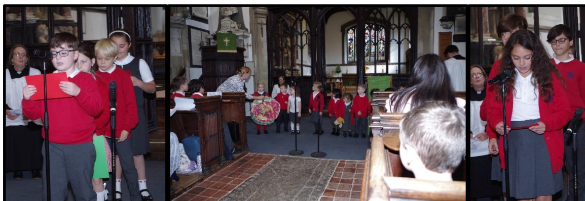
Harvest Festival Service