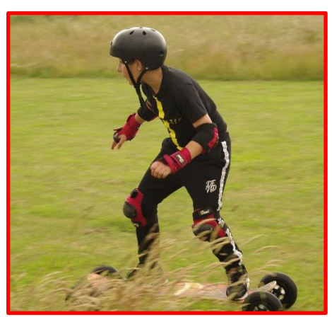
Climbing and mountain boarding