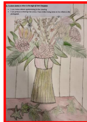
Drawing of Natural forms