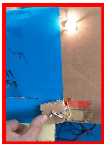
The light goes on when the door is opened