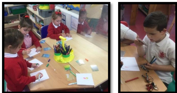
A mirror and very careful looking helps agree a deal when you are drawing a self portrait

"Encourage one another and build each other up." - 1 Thessalonians 5:11 "A friend is someone who knows all about you and still loves you." – Elbert Hubbard