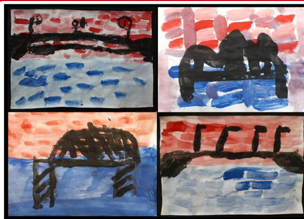
Exploring shade by adding white to red and blue