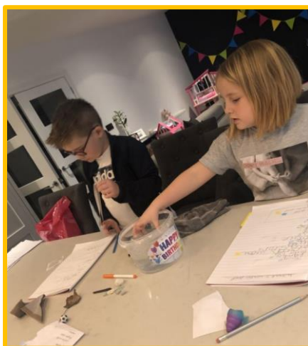
Science - testing which materials are waterproof