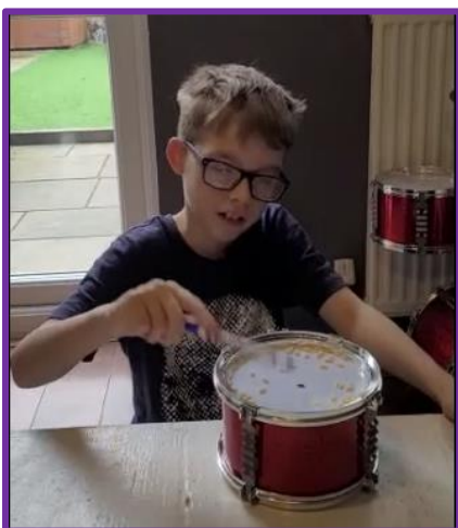
Science (experimenting with sound)

You also have had to get to grips with technology and I am sure in many cases new items. Some of the children do look like superstar DJs with their headphones. You have had to support your child in so many ways and try to explain things that are probably done in a different way to the way you were taught, providing encouragement and incentive and upload work. Some of you have found some excellent ways of making the learning practical and memorable.