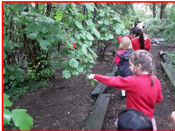
Collecting leaves for classification