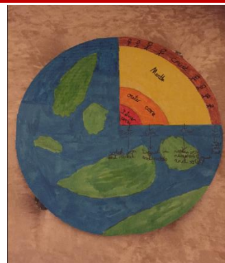
Henry - model of the structure of the Earth in Geography.