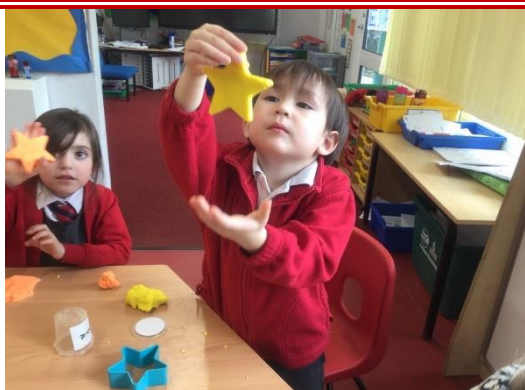
We are very proud of the stars we have made with dough

"Just as the Lord has forgiven you, so you must also forgive others."