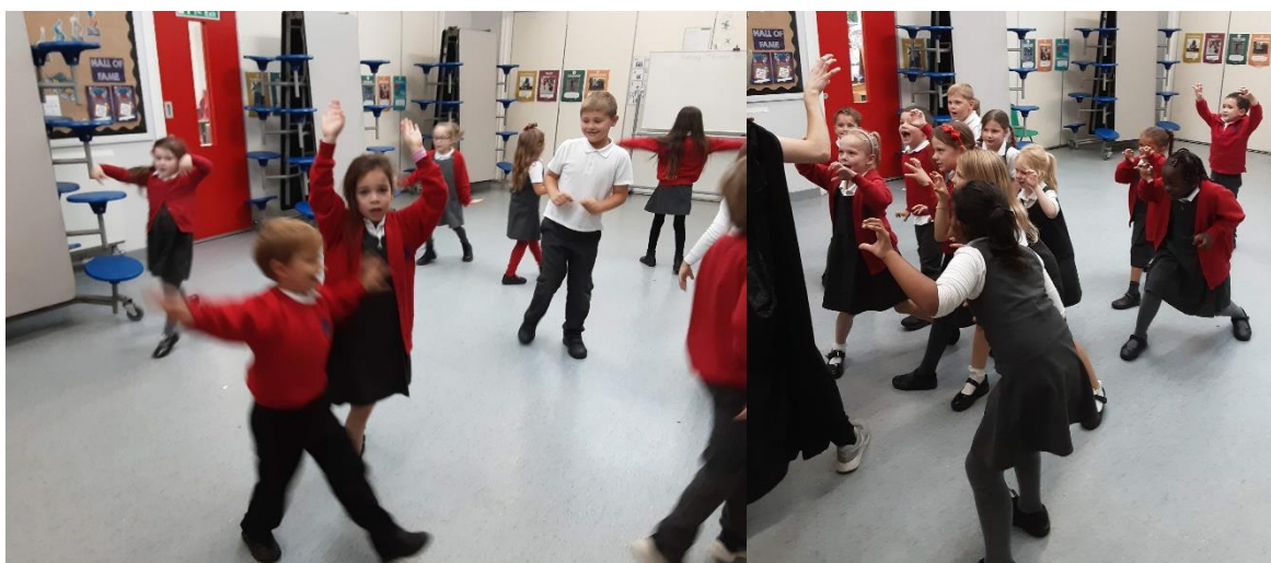
Sapphire Class Drama