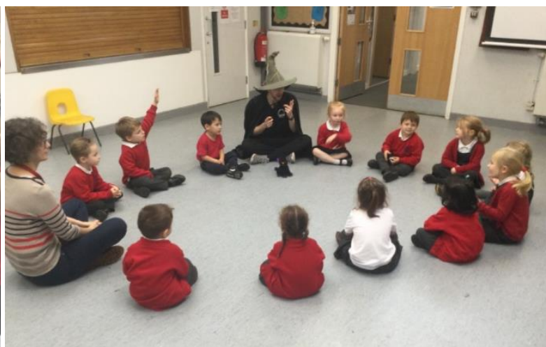
Drama for Ruby Class