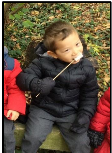
Reception – Round the Fireside