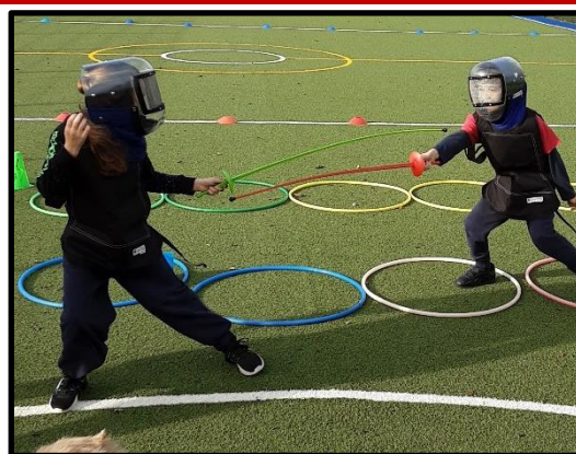
Sports Cool sessions for Ruby, Sapphire, Emerald and Diamond Class