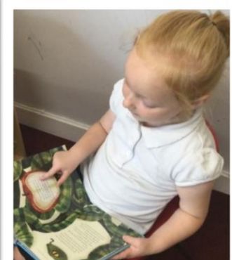
Some of the super learning the children enjoy in Reception