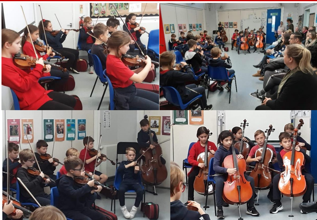
Diamond Class - Strings Lesson

'Clothe yourselves with compassion, kindness, humility, gentleness and patience.' Colossians 3.12