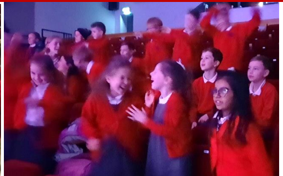
Jack and The Beanstalk