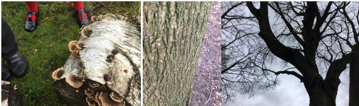
Some of Photographs Taken by Ruby Class