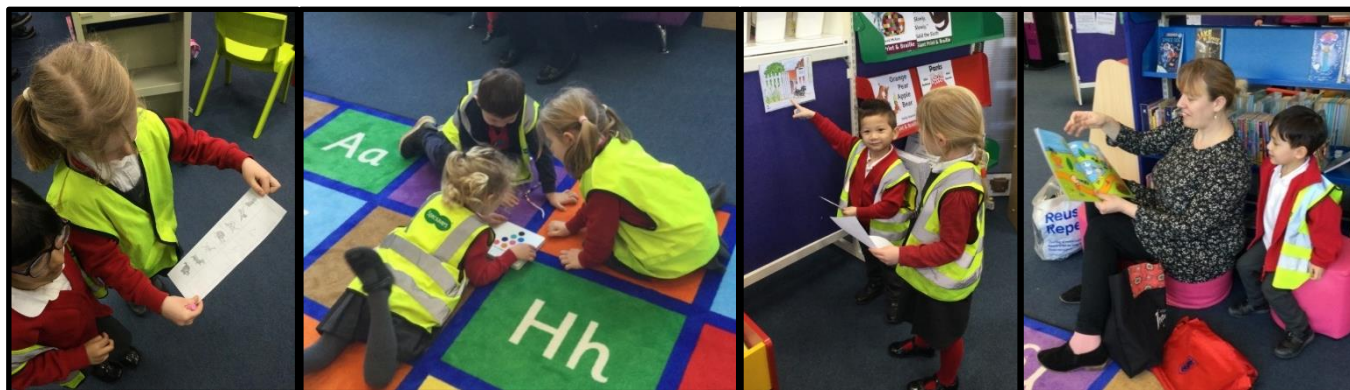
Ruby Class Visit to the Library