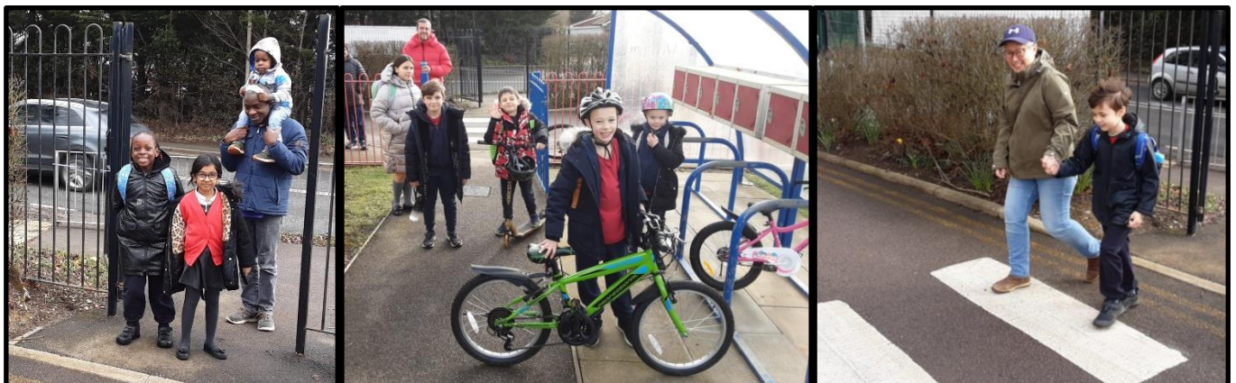
Walk and Wheel to School