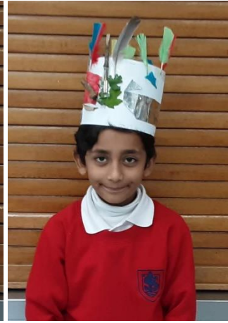
Emerald Class Crowns