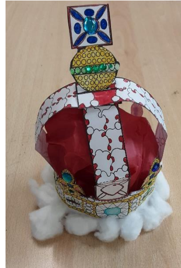
Diamond Class Crowns