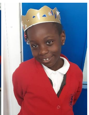
Ruby and Sapphire Class Crowns