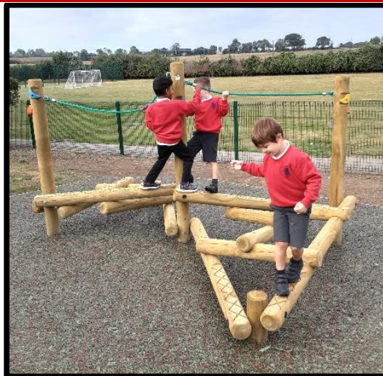
New Clamber Stack outside Sapphire Class