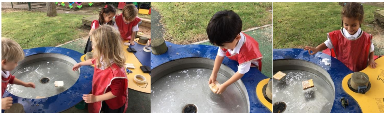
Ruby Class Floating and Sinking

‘Always be thankful.’ 1 Thessalonians 5.16