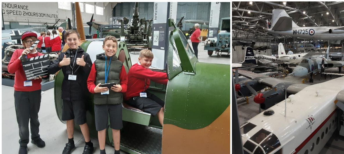
Diamond Class at Duxford

"Always giving thanks to God the Father for everything, in the name of our Lord Jesus Christ." (Ephesians 5.20)