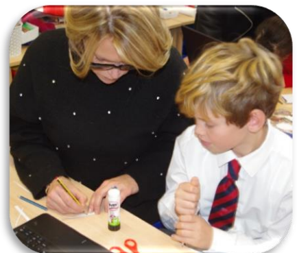
Decorations Day KS2