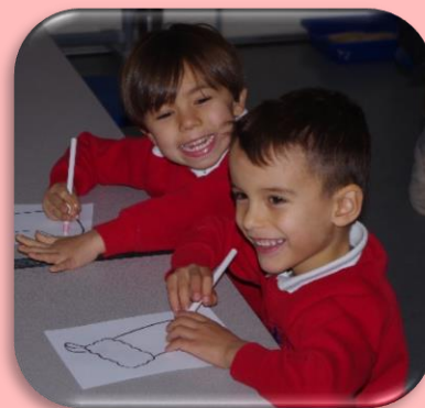
Decorations Day EYFS/ KS1