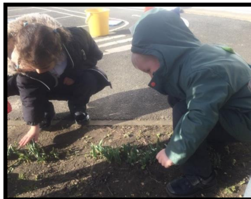
Ruby Class Plant Hunt