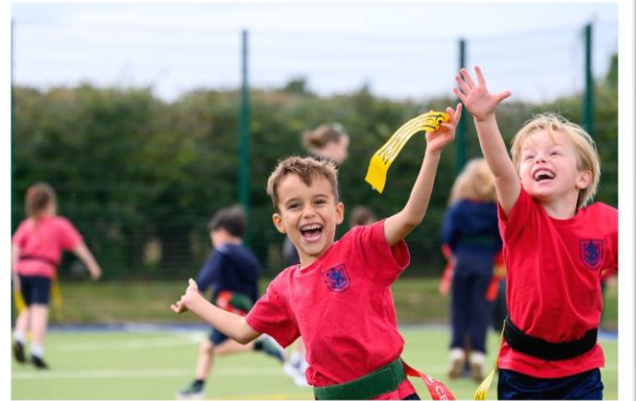
Another selection of pictures from the photographer's visit