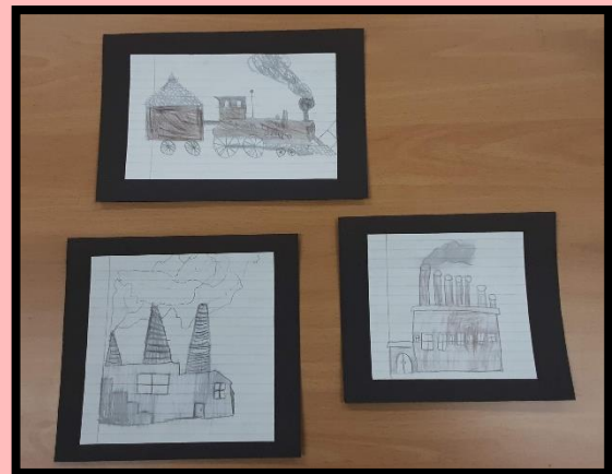
Diamond Class History

Diamond Class's current history topic is the Industrial Revolution. They have been carrying out research then demonstrating their learning using two -page spreads. Combining illustrations with text is believed to make learning more memorable and for some it certainly adds to their ability to focus and sustain concentration.