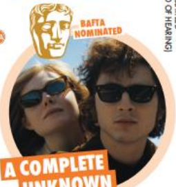
A COMPLETE UNKNOWN