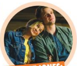
BRIDGET JONES: MAD ABOUT THE BOY