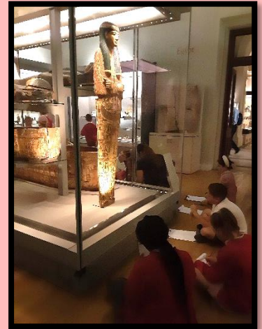
Emerald Class Visit to the Fitzwilliam Museum