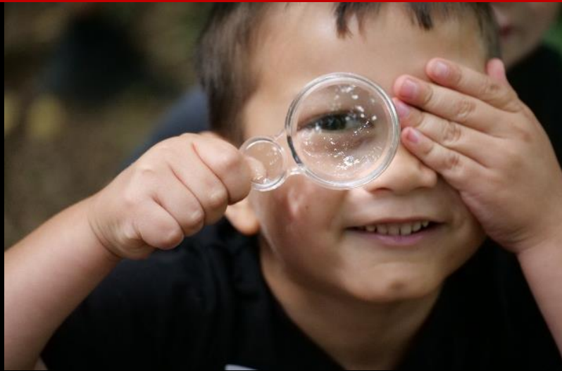
Outdoor Learning and Science Day

'Do to others as you would have them do to you.' Matthew 7:12